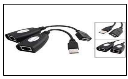
Figure USB Kabel LAN

USB is the abbreviation for Universal Serial Bus. USB is a technology that allows us to connect external devices (peripherals) such as scanners, printers, mice, keyboards (keyboards), data storage devices (zip drives), flash drives, digital cameras or other devices to our computers. USB strongly supports data transfer of 12 Mbps (million bits per second). Computers (PCs) currently, generally already have a USB port. Usually provided at least 2 ports. When compared with parallel ports and serial ports, the use of USB ports is easier to use.