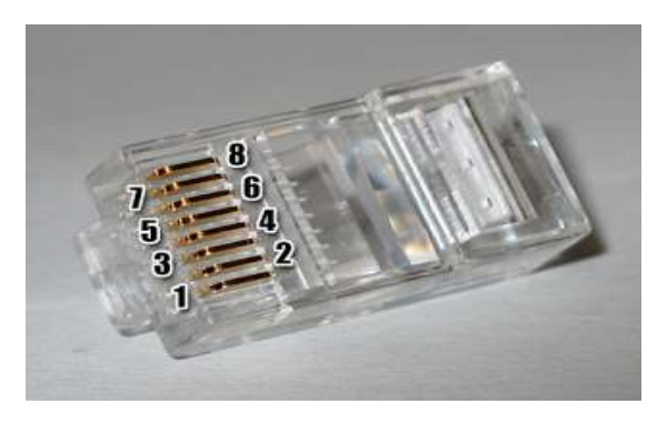
Figure 2. RJ45

RJ itself is an abbreviation of Registered Jack, which is a standard equipment in the network that regulates the installation of the connector head and cable sequence, which is used to 2 or more telecommunications connect equipment (Telephone Jack) or network equipment (Computer Networking). It is also a interface of а physical network. telecommunications and data communication purposes. The RJ45 connector has a function to make it easy to change telephone or make it easy to move around and is easy to unplug without worrying about being electrocuted and connecting the LAN connector through a central network.