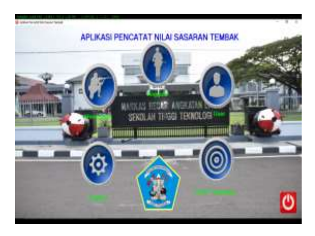
Figure Main Menu Design

Input / output design is a design in the image processing information system based on image processing, as a whole consisting of input and output designs.